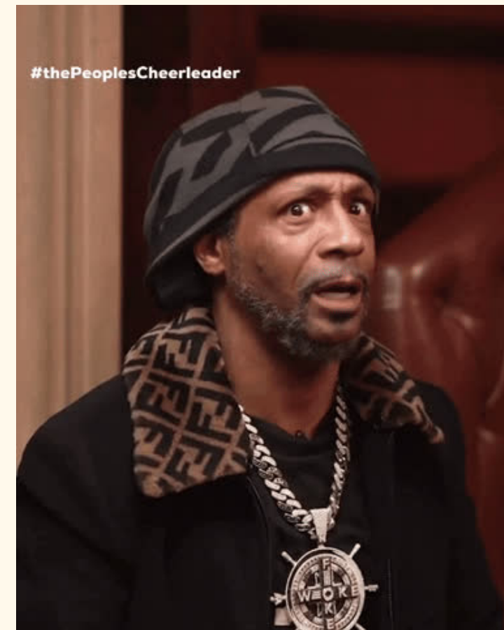
3. Not sure how to use it