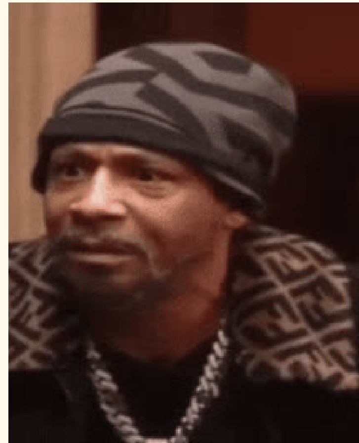
2. Tried it, not for me