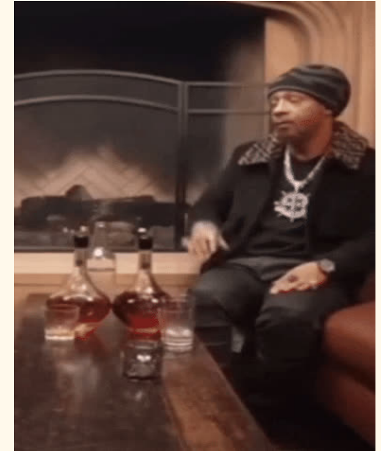
4. Already using it daily